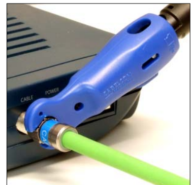
Proper tightening with the Pocket installer