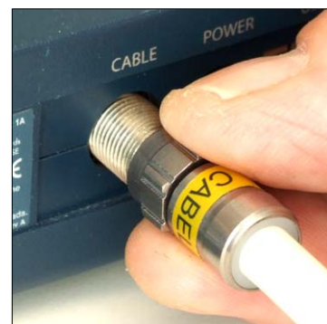
Self-Install™ with finger friendly nut

Use the Self-Install™ for CATV, satellite receivers, cable modems and other set-top box applications. The waterproof versions can be used for any outdoor application such as parabolic dishes etc.