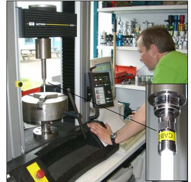
Computer controlled test of the pull strength