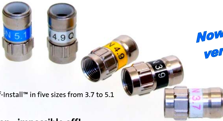
Self-Install™ in five sizes from 3.7 to 5.1