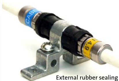
External rubber sealing mounted on Self-Install™

- is the perfect companion to go with a couple of Self-Install™ connectors for home installations. The pocket installer combines a RG6/59 cable stripper with mechanical stop for proper stripping length and an 11 mm spanner. The Pocket installer makes the cable preparation much easier and precise, while the spanner can be used for proper tightening.